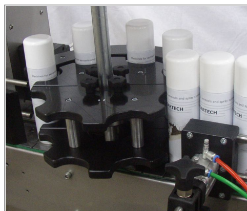
Rotational mechanism is a checkweigher DWR/H series

*- Profibus module available on client's request (option)